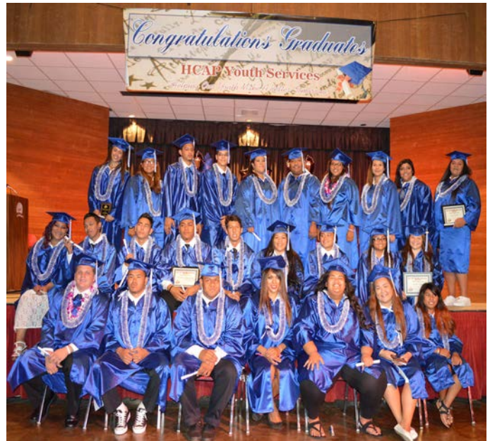
HCAP Youth Services Class of 2015