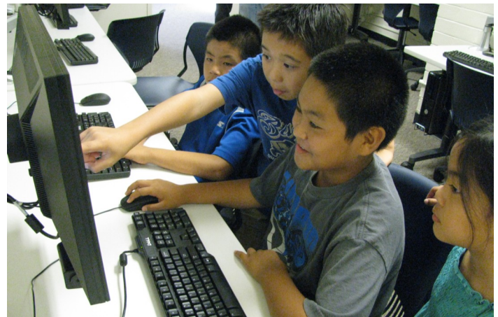
Participants in the Hā Initiative gain computer skills through fun after-school activities

HCAP's newest initiative puts a high-tech spin on after-school programs. The Hā Initiative opened its first site at Shim Memorial Hall on the grounds of St. Elizabeth's Episcopal Church. Offered free to kids Grades 2 to 8, the program promotes science, technology, engineering and math (S.T.E.M.) with fun, hands-on activities.