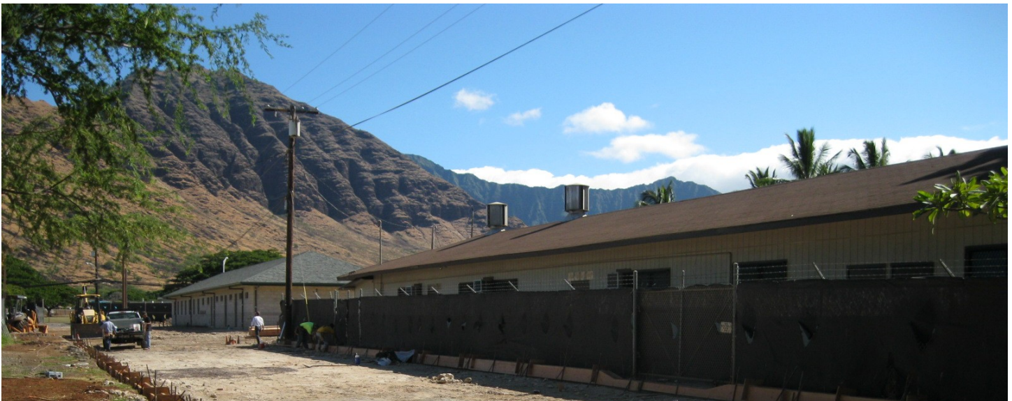
The Harry and Jeanette Weinberg Center for Community Action is nearing completion in Waianae, Oahu. The new west wing is the grey-roofed building at left.