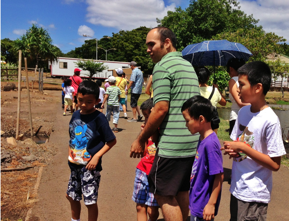
Students from the Kalihi Exploration Center visiting Hawaii's Plantation Village

The Hā Initiative had a very eventful quarter as summer was winding down and participants returned to school. As these summer months are crucial in helping students retain what they learned during the previous school year, our best efforts went to maintaining academic success while introducing them to new topics in the STEM fields.