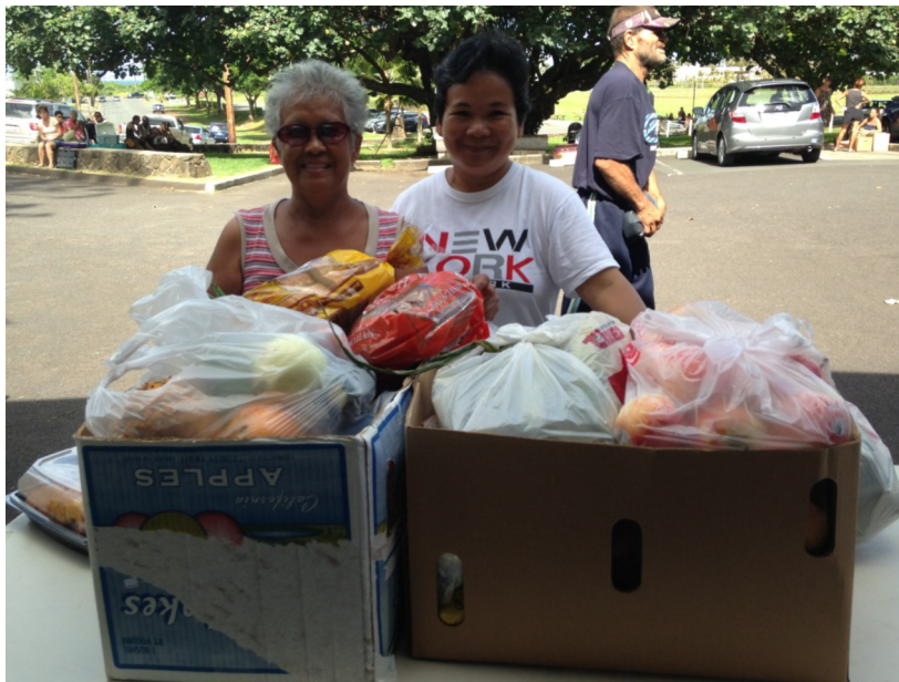
Thanks to the Ohana Produce program, these women are taking home fresh produce and non-perishable food to their families

HCAP has been partnering with the Hawaii Foodbank to distribute fresh produce, along with other perishable and non-perishable food items to individuals and families in need. Each month, the number of individuals and families who receive food from Ohana Produce distributions continues to grow. Currently, HCAP offers the Ohana Produce program through four District Service Centers: Windward, Kalihi-Palama, Central, and Leeward. This summer, in response to community requests, the Kalihi-Palama District Service Center started an Ohana Produce Program at the Kalihi Valley Homes (KVH) housing project. On average, the Ohana Produce program serves 900 families per month. Ohana Produce plays a big part in the lives of families around the island; many families rely on the food that is provided to supplement their diet. There is a high volume of seniors who live off a fixed income and struggle to make ends meet. The food that seniors receive from Ohana Produce greatly improves their quality of life. Clients often express their gratitude to HCAP and the Hawaii Foodbank for providing this service in their communities.