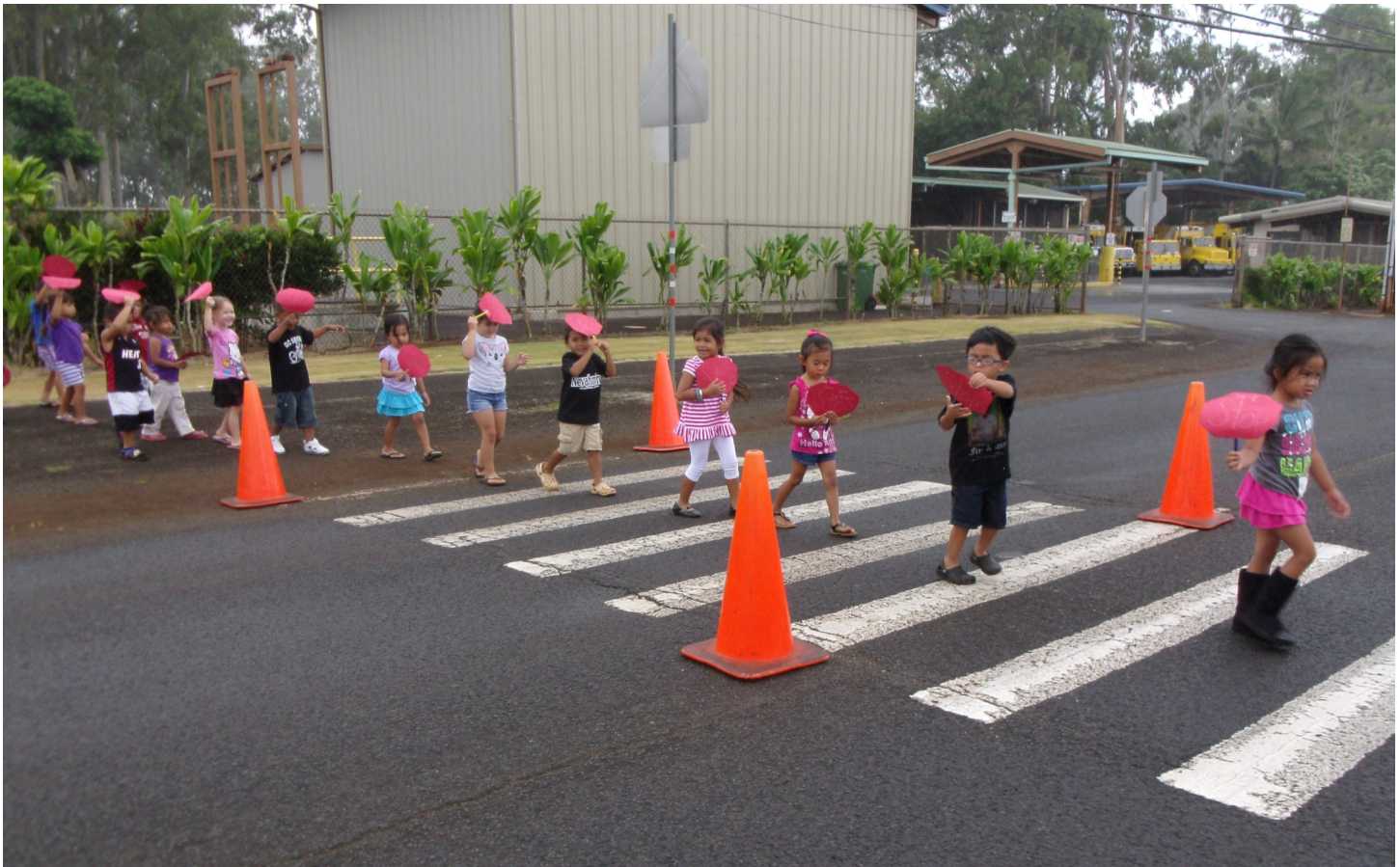
Students from Ka`ala Elementary Head Start Classroom practicing pedestrian safety with their handmade STOP signs