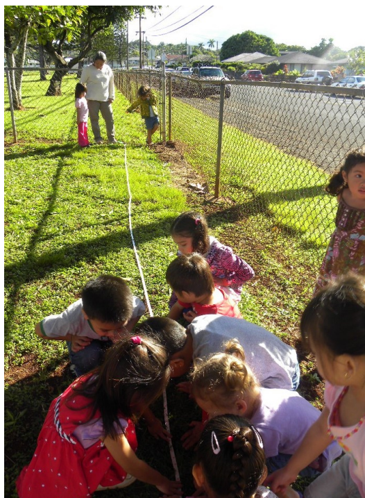
Learning measurement by creating a garden