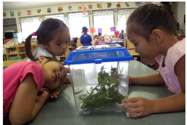
Observing nature's creatures at Wahiawa Pre Plus