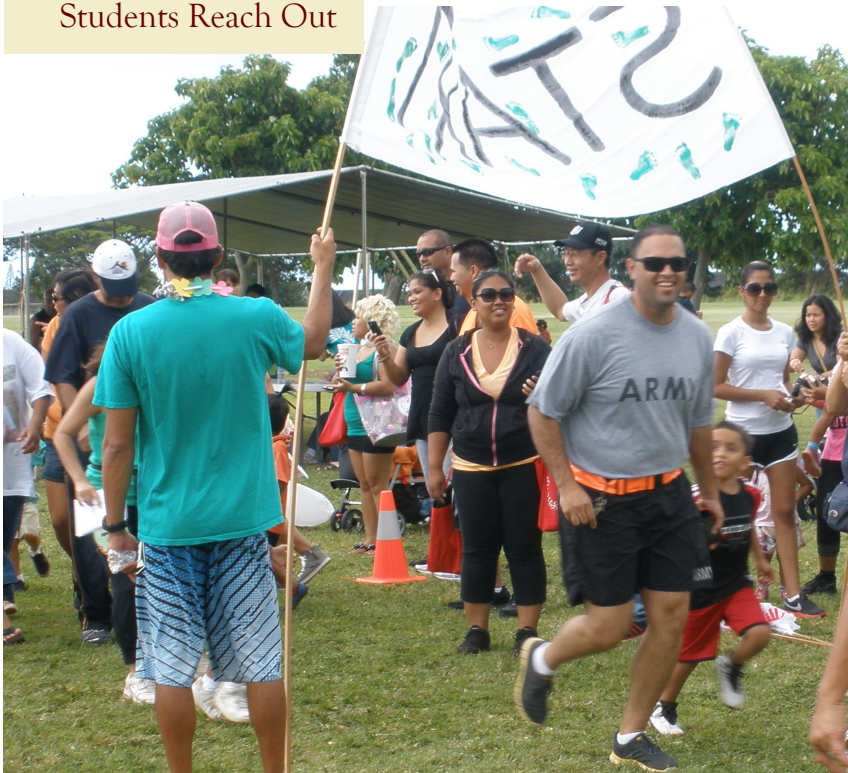
Father and son join the race together at the 2012 Head Start Keiki Fun Run

According to the State of Hawaii Department of Health, children and families in poverty are particularly vulnerable for a range of poor health outcomes, including obesity, diabetes, stroke and heart disease. Honolulu Community Action Program wants to be part of changing these statistics. Read on to learn more about HCAP's initiatives to increase awareness and improve family health, at all income levels.