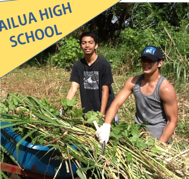
Having fun and working hard, Kailua High School students helped clear the land for planting at HCAP's Waimanalo farm