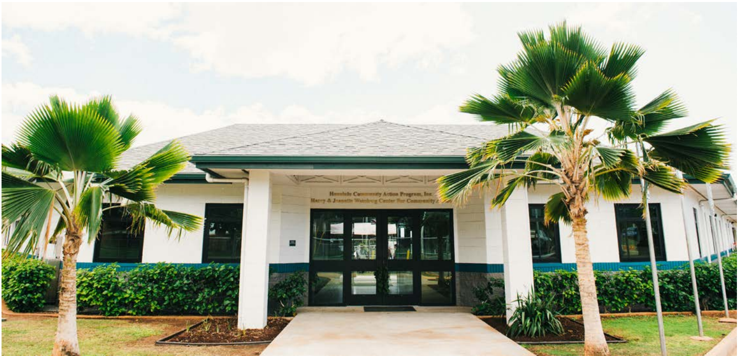
Harry & Jeanette Weinberg Center For Community Action- Leeward District Service Center