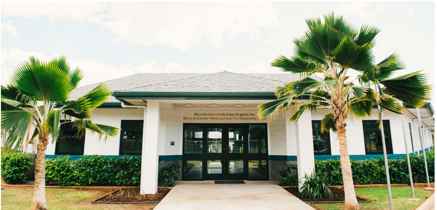
Harry & Jeanette Weinberg Center For Community Action- Leeward District Service Center