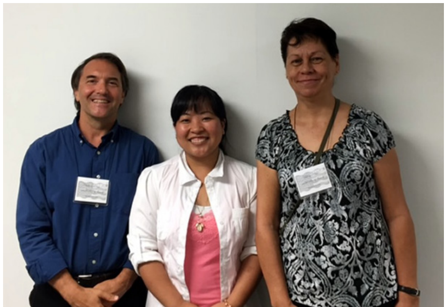
2014 Tax Season Volunteers

HCAP's EITC program volunteers are a talented, dedicated group of people that enable the program to continue growing, year after year. All volunteers that prepare returns must pass a written certification test that shows comprehension of the current basic income tax laws and then learn the specialized software used by preparers to complete the returns. It is a huge commitment on the part of each volunteer. In 2015, HCAP had 9 volunteers that assisted throughout the season. There is no way HCAP could help the number of people we do without the numerous volunteers that have assisted at our sites over the years.