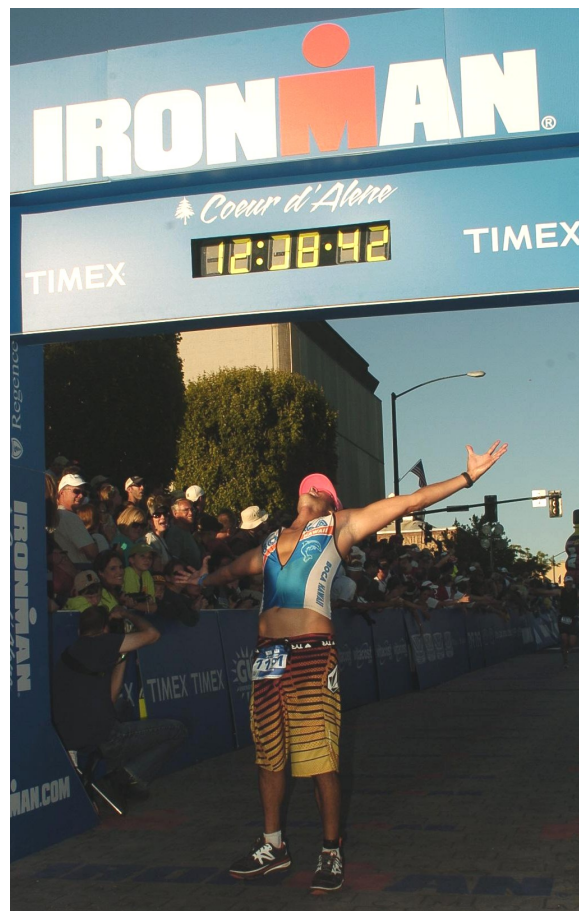
Celebrating at the finish line of the Ironman Coeur d'Alene in Idaho.

"I was out of control as a young man... but my fifth grade teachers gave me a chance to excel. From that moment, I changed my life and believed in myself."