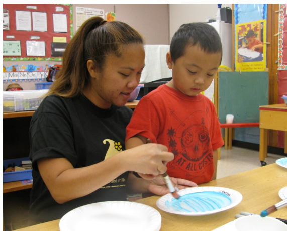
A parent volunteers in her son’s classroom at Head Start Kapalama

Every Head Start classroom chooses two parents to serve as a representative and an alternate on the Head Start Policy Council. The Council members meet regularly to vote on program policy, assist with hiring staff, and manage the program’s budget. They also serve as leaders in their own communities by bringing back what they have learned to share with other parents in their children’s classrooms.