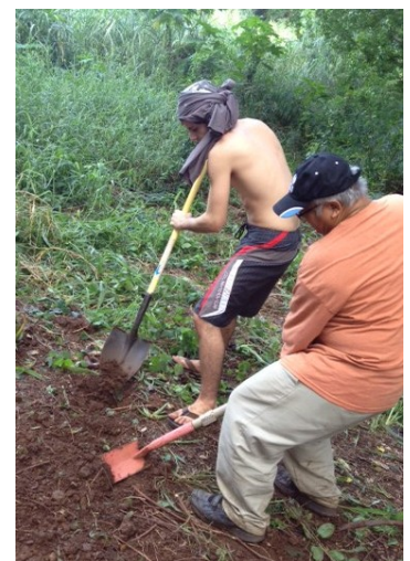
The Aina Corps Program is a partnership of LEAF Hawaii, Honolulu Community Action Program, Oahu Worklinks, the State of Hawaii Department of Labor and Industrial Relations and the U.S. Department of Labor. For more information, call (808) 389-1819 or visit www.leafhawaii.org .