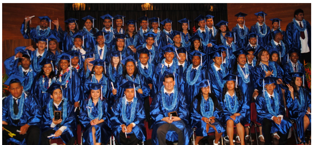
The HCAP Youth Services Class of 2012 at their graduation ceremony in June.

Youth Services continues to offer the Competency-Based High School Diploma (C-Base) program Monday through Thursday at its classroom near downtown Honolulu. The program recently expanded its services to include driver's education and one-on-one individualized tutoring. Youth Services is also involved in an innovative partnership with the Honolulu Police Department, which brings in police officers to work with the C-Base students on leadership and team building. In addition to learning valuable skills, the positive interactions between the students and officers helps to create a shared sense of responsibility for keeping themselves and the community safe. Youth Services is also embarking on a partnership with the City and County of Honolulu Department of Community Services on a $1.5 million grant from the U.S. Department of Labor. The grant will provide education, job training and support to young adults who have been involved in the juvenile justice system.