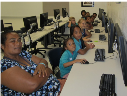
The program's two locations are fully equipped with computer labs, science exploration centers and music recording studios.

Reverend Takie Okumura Family Foundation St. Elizabeth's Episcopal Church Kalihi Interagency Community Group Waianae Civic Center—Pai`olu Kai`aulu Hawaii Pacific University EAH Housing Retired Seniors Volunteer Program Foster Grandparent Program