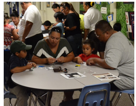
Family engagement is a key part of the program. At Family Nights, parents work on science projects with their kids which they can also make at home.