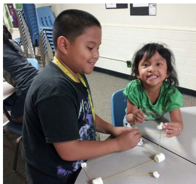
Every weekday afternoon, children participate in hands-on explorations in science, technology, engineering and math.