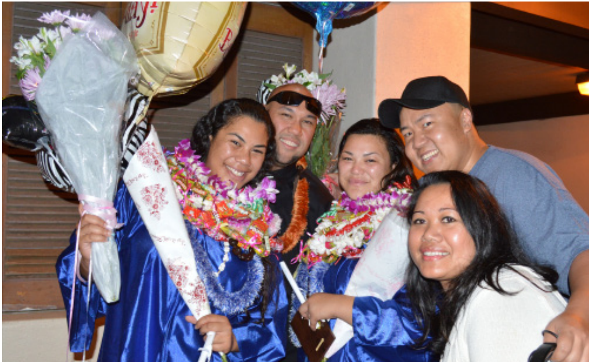
Youth Services Graduates Celebrate with Friends and Family